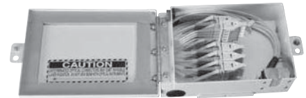
Rapid Fiber RDT using slider adapter packs

Eliminates the need for splice cases and separate cable assemblies by integrating the patented RapidReel fiber cable spool. The RapidReel cable spool includes a built-in reel enabling quick payoff of up to 500 feet of MPO stubbed 12 or 24 count optical fiber cable from a single 6"x9" wall box. The MPO stub is pulled for installation into either the collector enclosure or directly to an indoor or outdoor fiber distribution hub, panel, connector or adapter with MPO compatibility. After installation the spool flanges can be broken away and the wall box is secured to the wall safely storing the remaining slack cable. Use of factory terminated and tested MPO connectors instead of splicing provide a plug-and-play environment that reduces labor costs and speeds project completion.