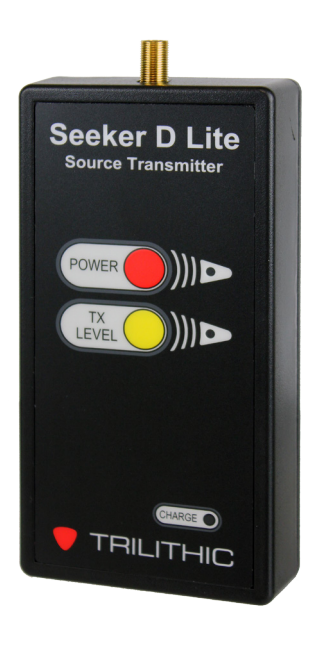
Easily find & fix the smallest, hardest-to-find sources of ingress into your plant