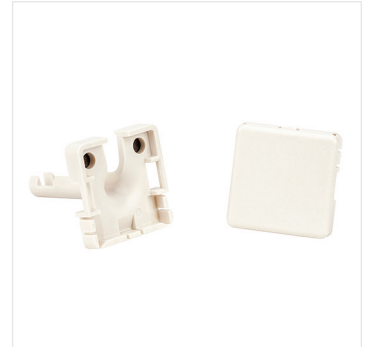
Micro Point-of-Entry Wall Cover