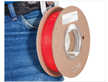
Belt Clip Spool Holder on Clear Track ILU Fiber Pathway Spool