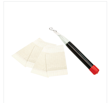
Clear Track Hallway/ILU/QUAD Wall Compatibility Test Weight and Test Strips