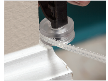
Clear Track ILU Installation Tool