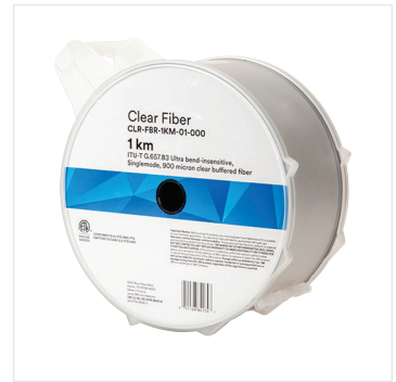
900 μm Clear Fiber, 1 km Spool ITU-T G.657.B3 Grade