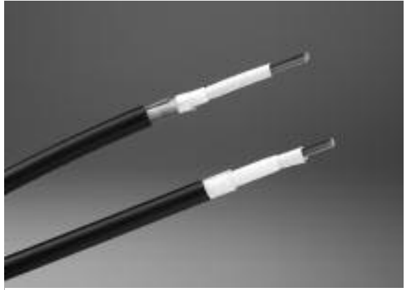
432-Fiber SST-UltraRibbon Dielectric Gel-Free Cable | Photo CLT61