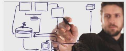
Professional Service/ Field Engineering